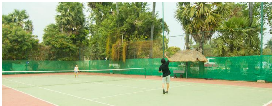
❖ Tennis Courts