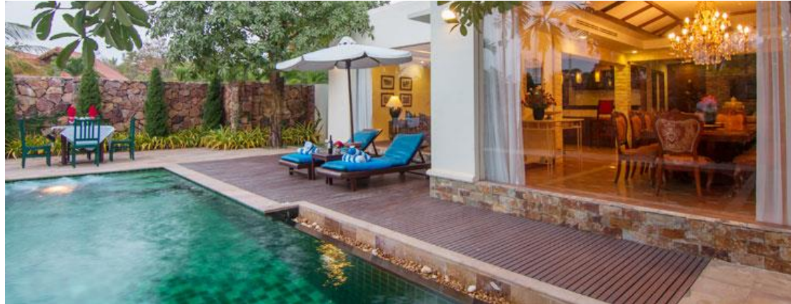
❖ 1, 2 & 3 Bedroom Pool Villas