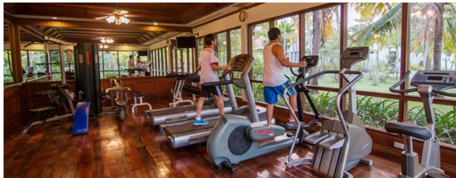
❖ Fully equipped Gym