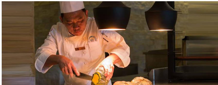
❖ Khmer Cooking Classes

Angkor Palace Resort & Spa Siem Reap, Kingdom of Cambodia